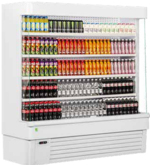
Remote Multideck Chiller (Close door option available in Chiller & Freezer)

Accessories optional, product image are for representation, actual product might vary.