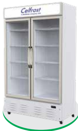
FKG-909DD/1200C/1000C** (FKG-1000C top mounted compressor & aluminum door frame)