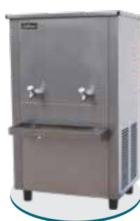
S.Dlx. 60/120 SDLX 61-121