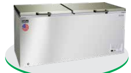
CF-435 DD SS