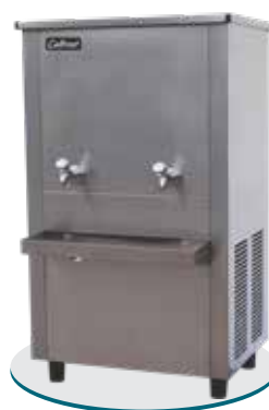
S.Dlx. 150/150 SDLX 151-151