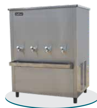
S.Dlx. 200/400, 400/400 SDLX 201-201