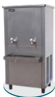
S.Dlx. 40/80 SDLX 41-81