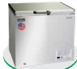
CF-330 SS/430 SS