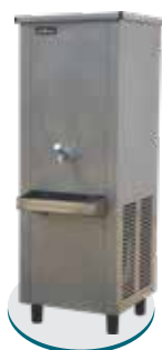
S.Dlx. 20/40 SDLX 21-41